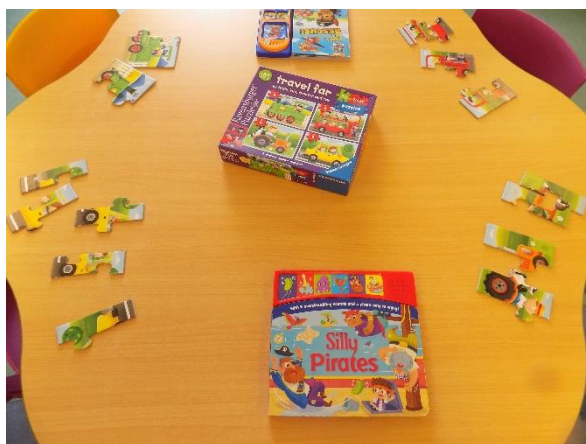
We also enjoyed our new Pirate Book