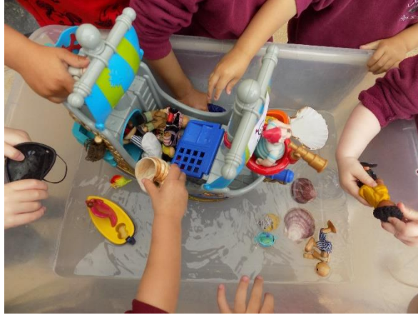
We sailed the wild and treacherous seas searching for our treasure