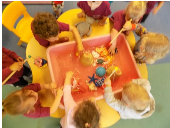
We went fishing, watching out for sharks in the deep, deep water!